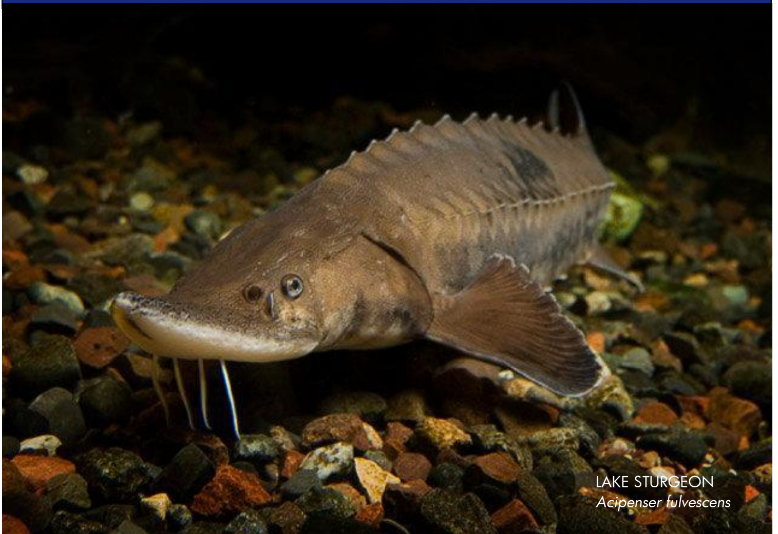
LAKE STURGEON Acipenser fulvescens